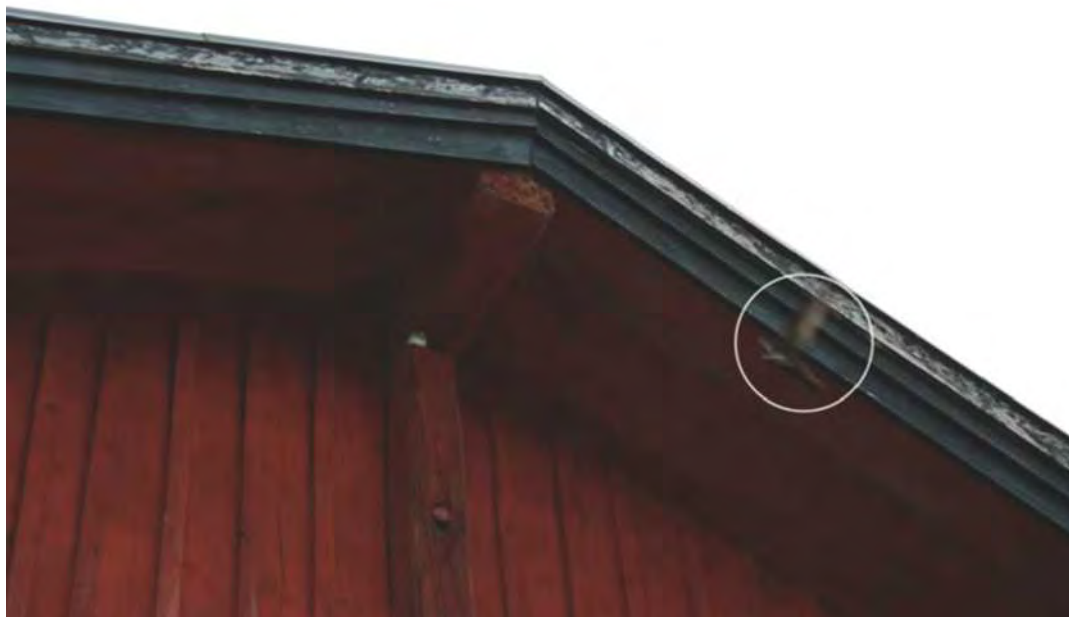
Figure 1. Fly-in of a Common Swift toward a perching young House Martin. The Swift is circled. En tornseglare flyger in mot en sittande ung hussvala. Tornseglaren är inom ringen.